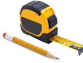
Tape Measure and Pencil