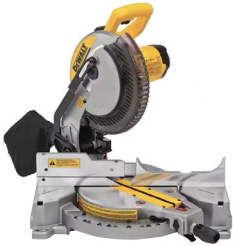
Miter Saw (with nonferrous blade)