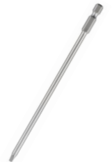
6in #2 Square Drive Bit