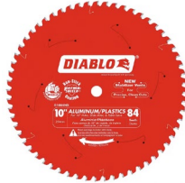
84-Tooth Nonferrous Blade