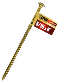
GRK® RSS™ 5/16in x 6in Grade C Yellow Zinc Washer Head Structural Screw

Available at Home Depot. Model # 96015 SKU # 1000037095