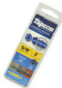
Tapcon® 5/16in x 3in Hex Washer Head Concrete Anchor

Available at Home Depot. Model # 24193 SKU # 554001