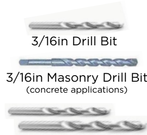
3/16in Drill Bit 3/16in Masonry Drill Bit (concrete applications) 5/16in and 5/8in Drill Bits (for LED Lighting application)