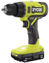
Cordless Drill (hammer drill for concrete)